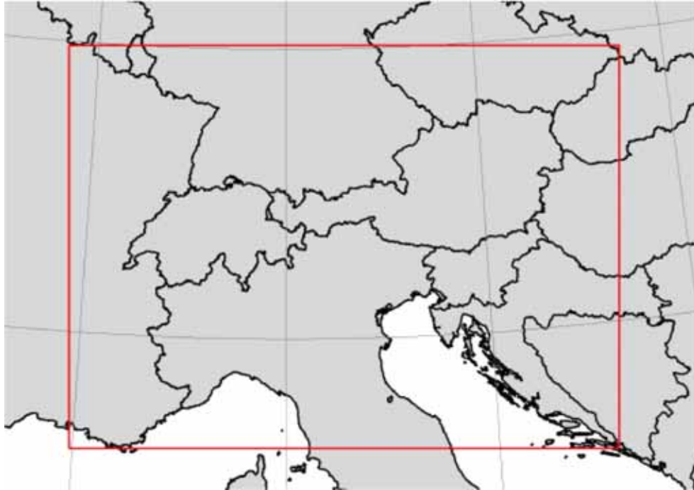
Figure 1: Study area geographic position.

The area chosen as modelling arena includes completely the national boundaries of Austria and Slovenia, and encompasses the entire Alpine part of Italy (Figure 1). Its approximate extent is from 4°E to 18°E and from 43°N to 50°N. Due to geographical coverage of available data, all the modelling effort has been concentrated on a smaller area, containing the entire Austrian and Slovenian territory, and only the Alpine and pre-Alpine part of the Italian territory.